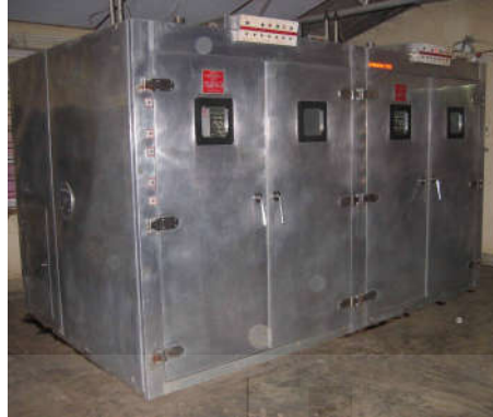
Fig. 4.1: Setter