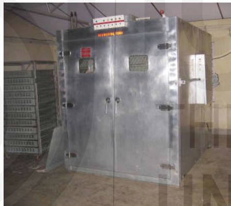
Fig. 4.3: Hatcher