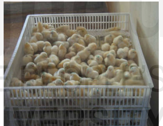
Fig. 4.4: Hatcher tray with day old chicks