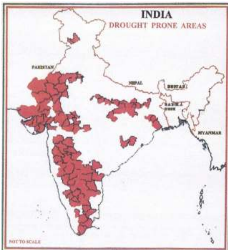
Fig. 2.1: Drought Prone Areas of the Country