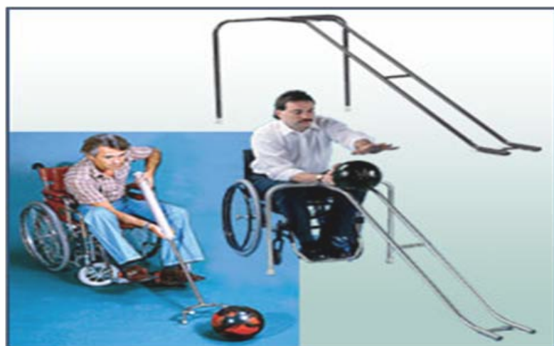
Fig. 15. 10: Recreation and Leisure Aids

Recreation and Leisure: Students with physical, sensory, and intellectual disabilities require assistive technology in order to participate more fully in appropriate recreation and leisure activities. A range of low technology to high technology solutions are available for them and include game adaptations, book adaptations, switch adapted toys, and environmental control access for televisions, videos, tape players, CD players and MP3 players.