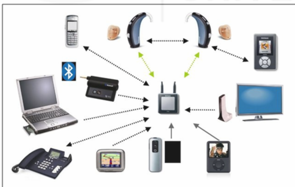
Fig.15. 4: Assistive Listening Devices

Assistive Listening Devices and Environmental Aids: Students who are hard of hearing or deaf, often need assistive technology to access information that is typically presented verbally and accessed through the auditory modality. A variety of technology aids or devices that are available to-day amplify speech and other auditory signals or that provide an alternative to the auditory modality are available today. These include assistive listening devices that amplify sound and speech both in the classroom and home environment, text telephone (TT), closed captioning devices, real time captioning, and environmental aids that support independent living skills.