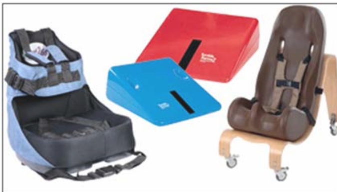
Fig. 15. 11: Seating and Positioning Aids

Seating and Positioning: Students with physical disabilities often require adaptive seating and positioning systems as an alternative to the standard classroom seating systems. Adaptive seating and positioning systems include seat inserts for wheelchairs, side liers, prone standers, and adaptive chairs. These seating and positioning systems are generally determined by the physical and occupational therapist in consultation with the classroom staff. Several different seating and positioning devices for the classroom are available in national and international market these days.