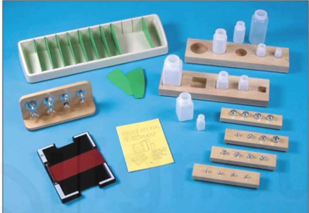
Fig. 15. 9: Pre Vocational and Vocational Aids

supporting work materials. For students using electronic appliances such as staplers and paper shredders, an environmental control unit such as the model available from AbleNet can be used to allow for switch control of the appliance. Many of the adaptations required for participation in work activities may be teacher constructed. For example, a picture-based task schedule can be created to represent all of the steps in a particular activity for students with intellectual disabilities.