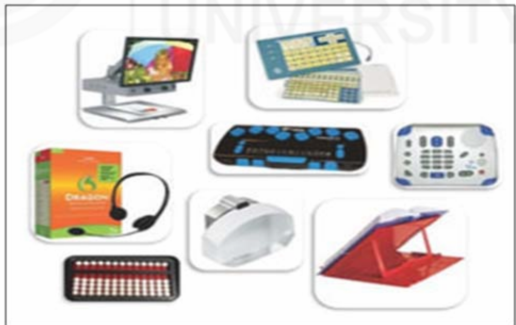
Figure 15.2: Academic Learning Aids

Academic Learning Aids: Many students with disabilities use assistive technology to enhance their participation and achievement in their educational programs. There are a range of assistive technology solutions to address student needs in all academic areas including reading, writing and spelling, math, and study and organization.