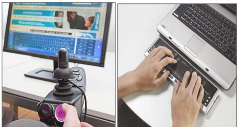
Fig.15. 6: Computer Access and Instruction

Computer Access and Instruction: A variety of technology solutions are available to adapt the classroom computer for students with disabilities. Some computer access technologies offer a method of input other than the standard computer keyboard and mouse. Other computer adaptations include software and hardware that modify the visual and sound output from the computer. There are a variety of such devices. Some of them are adaptive pointing devices, keyboard adaptations, alternative keyboards, touchscreens, onscreen keyboards, mouse alternatives, voice input devices, and environmental aids.