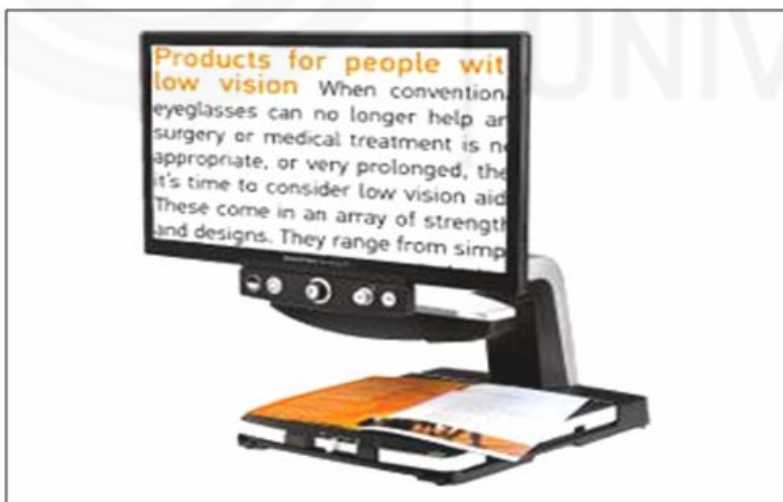
Fig. 15. 12: Visual Aids

Visual Aids: Students with visual impairments can benefit from ‘assistive technology’ in a variety of areas. A critical need for ‘assistive technology’ is often in the area of accessing printed information and to providing a means of producing written communication. There are many visual aids including talking dictionaries, adapted tape player/recorders, large print and talking calculators, Braille writers, closed circuit televisions (CCTV), and software such as screen reading and text enlargement programs.