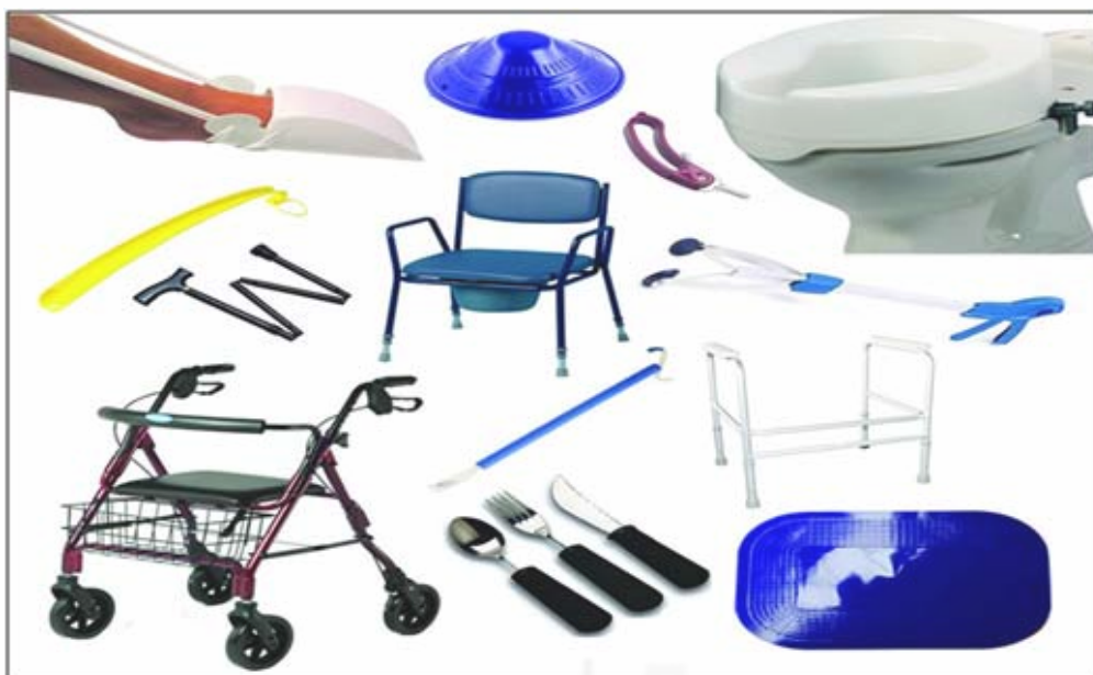
Fig.15. 3: Aids to Daily Living

independently. Daily living aids include aids for tooth brushing, eating, drinking, dressing, toileting, and home maintenance. These are typically used by students with physical disabilities.