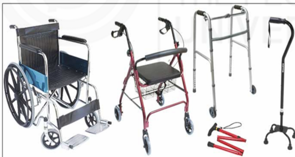
Fig.15. 8: Mobility Aids

Mobility Aids: Students with physical disabilities often need access to mobility aids to provide them with a means of moving about their environments. Mobility aids include: canes, crutches, walkers, scooters, and wheelchairs. Generally, assistive technology devices such as the mobility aids referenced above are recommended by physical and occupational therapists and are based on the student’s individual needs.