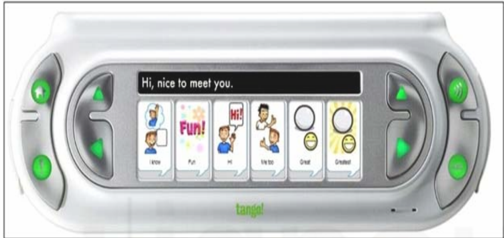
Fig.15. 5: Augmentative Communication

Augmentative Communication: Students with severe expressive communication impairments have difficulty communicating with peers and adults within their environments. Many of these students need a means of supplementing their communication skills. What these students should actually use are augmentative communication technology devices ranging from low technology to high technology. Today, these are available and include: object-based communication displays, picture communication boards and books, talking switches, voice output communication devices and computer-based communication devices.