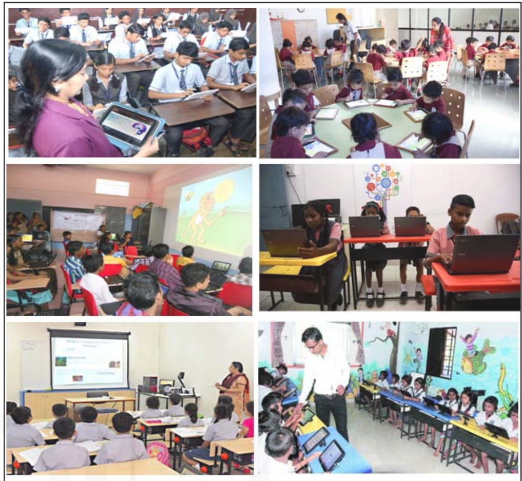
Fig. 9.2: A Few Pictures of ICT Enabled Classroom

Each school will be equipped with at least one computer laboratory with at least 10 networked computer access points to begin with. Each laboratory will have a maximum of 20 access points, accommodating 40 students at a time. The ratio of total number of access points to the population of the school will be regulated to ensure optimal access to all students and teachers.