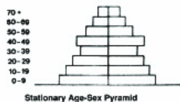
Fig. 1.2: Age Sex Pyramid